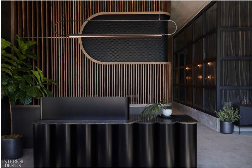
The wellness bar at Remedy Place in Los Angeles, designed by Bells + Whistles.