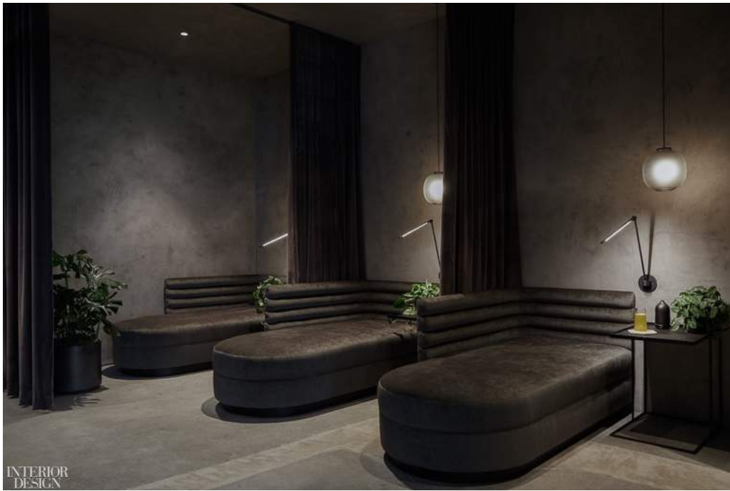
Velvet lounge beds at Remedy Place in Los Angeles, designed by Bells + Whistles.

Slatted wood distinguishes the reception desk and the wellness bar, both custom. Open to the general public, the wellness bar aims to lure a regular clientele with health-conscious meals and alcohol-free drinks using locally sourced ingredients. It incorporates a variety of seating niches, which generate a buzz “evocative of every client’s favorite hotel lobby,” notes St. John.