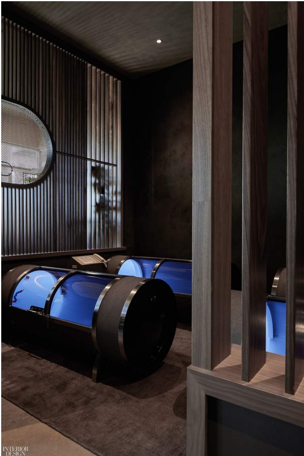
Hyperbaric chambers at Remedy Place in Los Angeles, designed by Bells + Whistles.