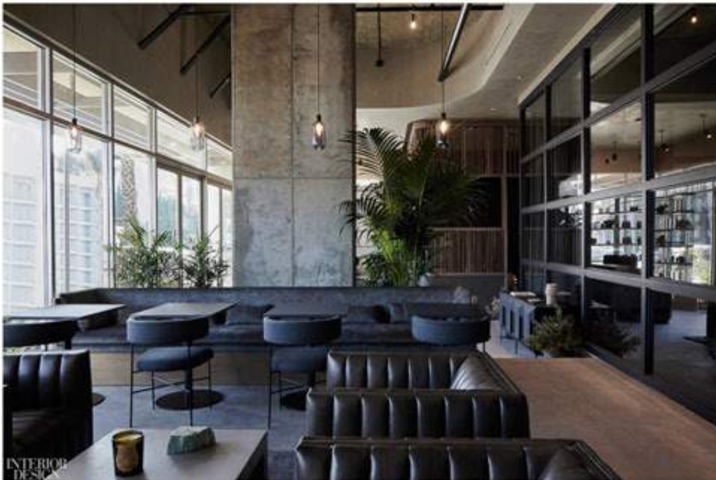
A lounge at Remedy Place in Los Angeles, designed by Bells + Whistles.

What’s a “social wellness club”? Los Angeles is set to find out with the opening of a facility billed as the first. The brainchild of Dr. Jonathan Leary ( http://drjleary.com/ ), a doctor dedicated to natural healing, Remedy Place ( https://www.remedyplace.com/ ) in West Hollywood features a dark and moody interior by L.A.-based interior design firm Bells + Whistles ( https://www.allthebellsandwhistles.com/ ) geared towards a unique blend of self-care and social interaction.