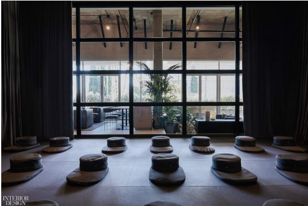
The wellness bar at Remedy Place in Los Angeles, designed by Bells + Whistles.