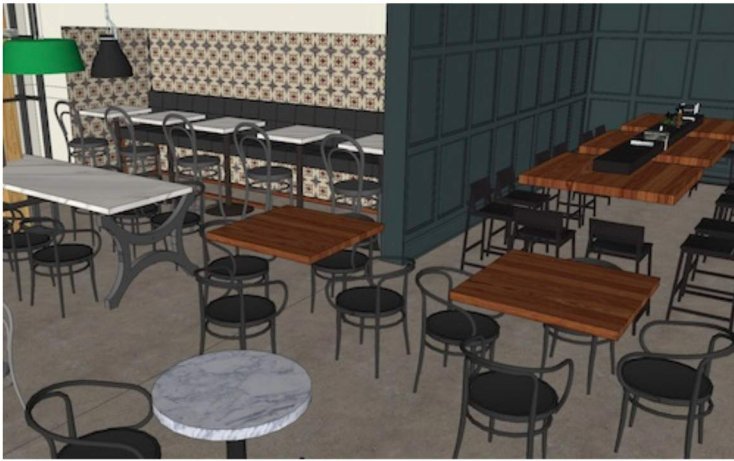
[Sea & Smoke, courtesy rendering]

You voted < http://sandiego.eater.com/archives/2013/06/21/vote-now-for-your-favorite-summer-opening.php > , we took note.