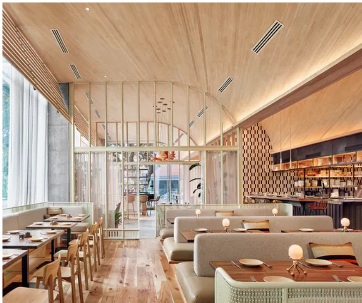
ATX Cocina, Austin, TX. Designed by: Michael Hsu Office of Architecture.