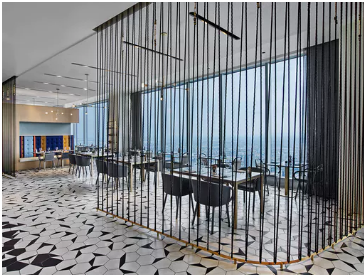
Finalist in the Restaurant Category: Dekkadance & Sora, Los Angeles, CA. Designed by: AC Martin.

Done well, restaurant design can be transformative and transportive, and can even make the food actually taste better. It is one of the most important factors of the dining experience, playing a key role in customer satisfaction and ultimately, the success of a restaurant.