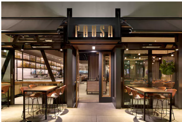
PAUSA Bar & Cookery, San Mateo, CA. Designed by: CCS Architecture.