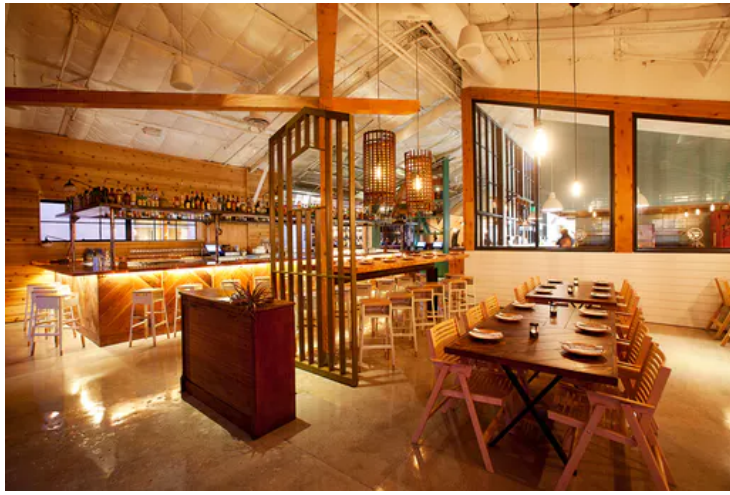
Campfire, Carlsbad, CA. Interior Designed by: Bells + Whistles, Architect: Aero Collective.