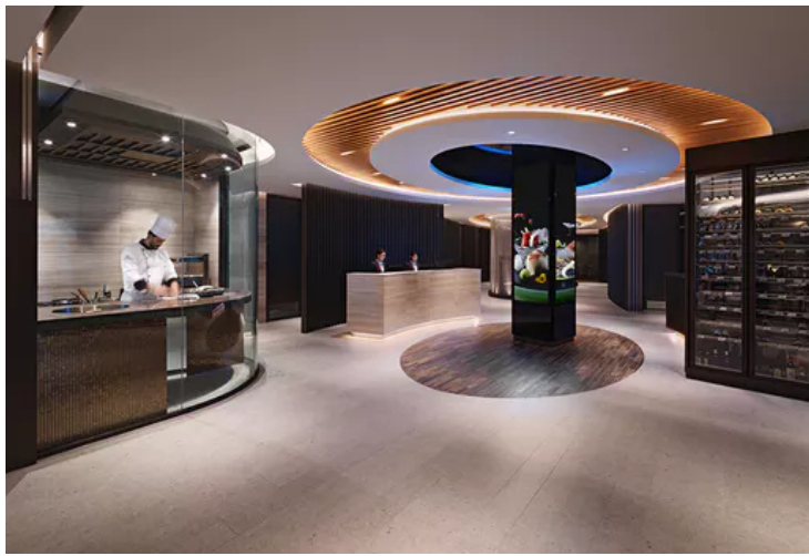
Asian Live, InterContinental Seoul COEX Hotel, Seoul, Korea. Designed by: CallisonRTKL.